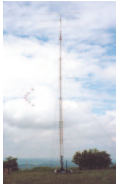
The Red Arrows stage a fly-past by the Bristol Contest Group's, GQ6YB, antennas.

Kaunus. Leading the following pack was the Latvian Contest Club station YLOA, operated by YL2KA.